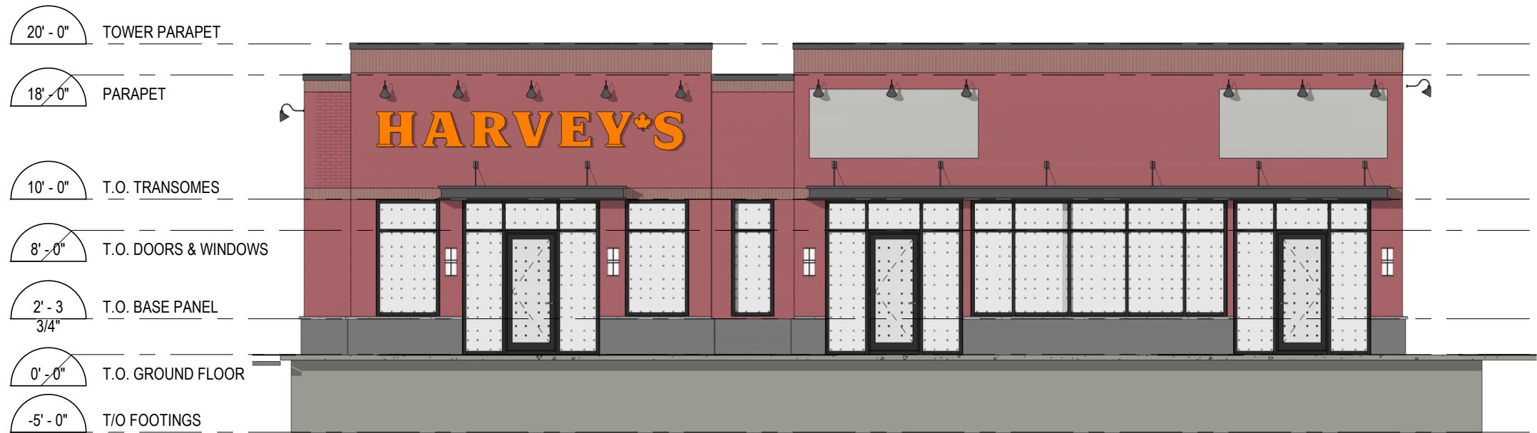
2 WEST ELEVATION DSK-006 1/8" = 1'-0"