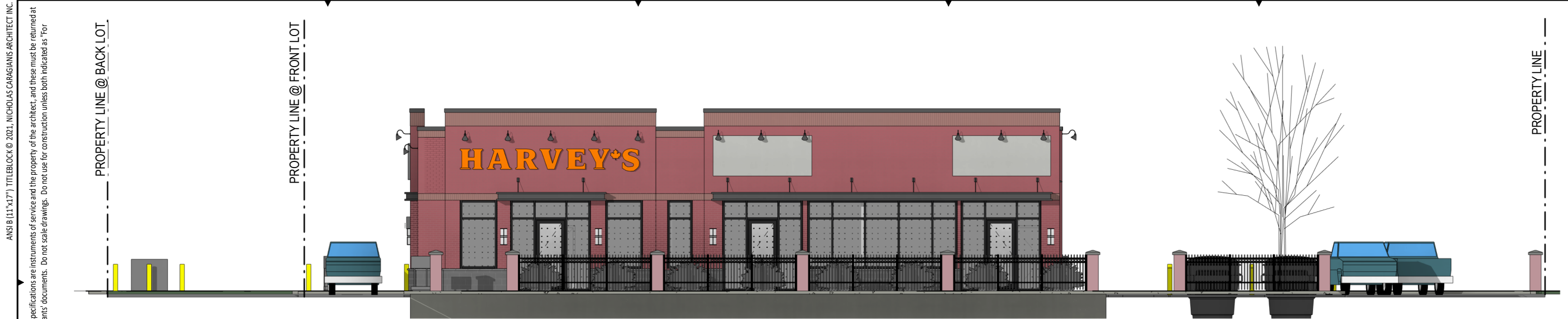
1 WEST ELEVATION - SANDWICH STREET DSK-006 3/32" = 1'-0"