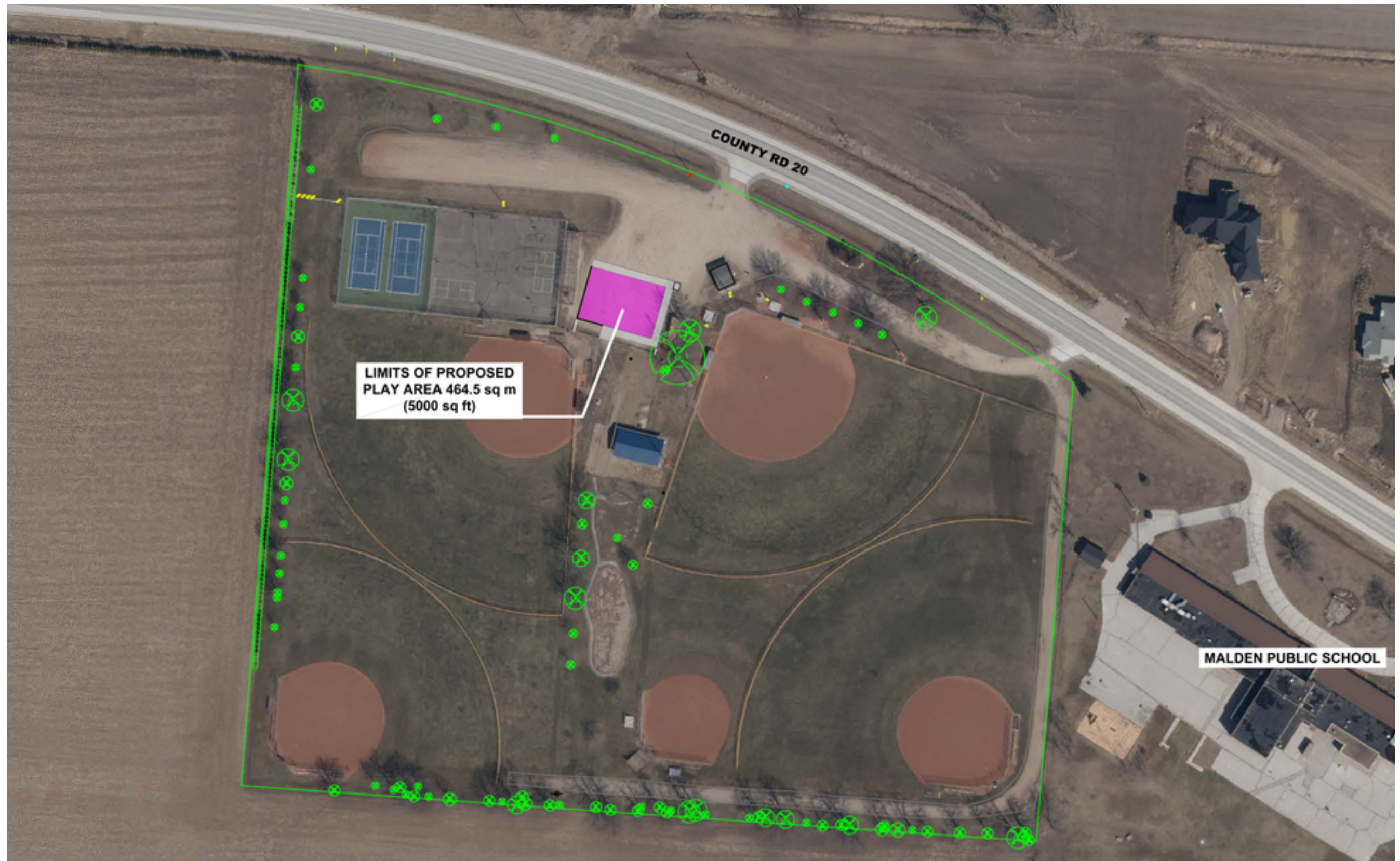
MALDEN CENTRE PARK - 5460 County Rd 20 AERIAL MAP with PLAYGROUND LOCATION FEBRUARY 2025