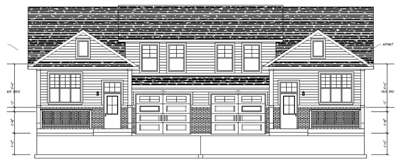
Figure 2 – 131-133 Park Street proposed front elevation

On January 10<sup>th</sup> 2025 the designer met with the Heritage Planner to discuss how the existing design could be further refined to address the Heritage Planners recommendations while still meeting the owners objectives. On January 22<sup>th</sup> 2025 a final itteration of the design was submitted to the Planning Department.