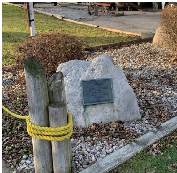
Figure 1 – Existing 1967 Commemorative plaque.

The Town of Amherstburg recognizes the 100 year anniversary Of the Amherst Pointe Association.