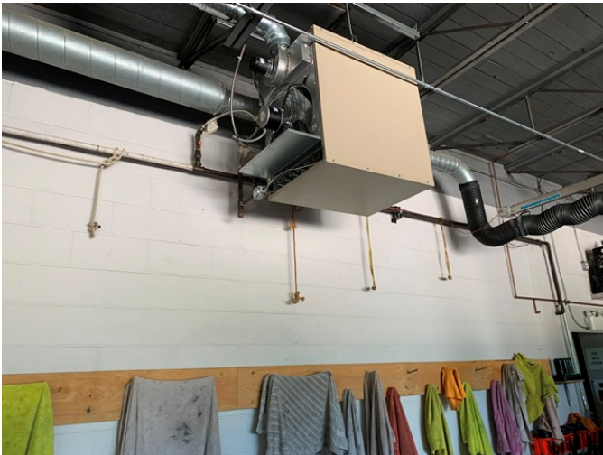
Figure (5) Interior View – Unit Heater