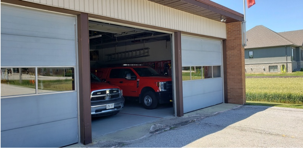
Figure (1) Asset Exterior – Overhead Doors are too small for the new Fire Trucks