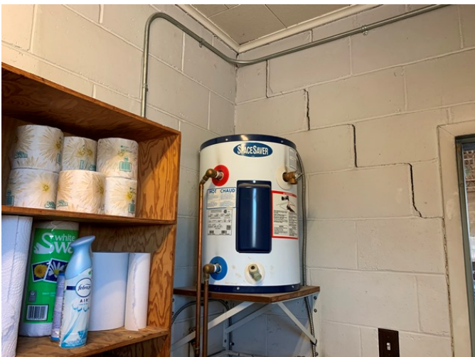
Figure (7) Interior View - Observed Step Cracking