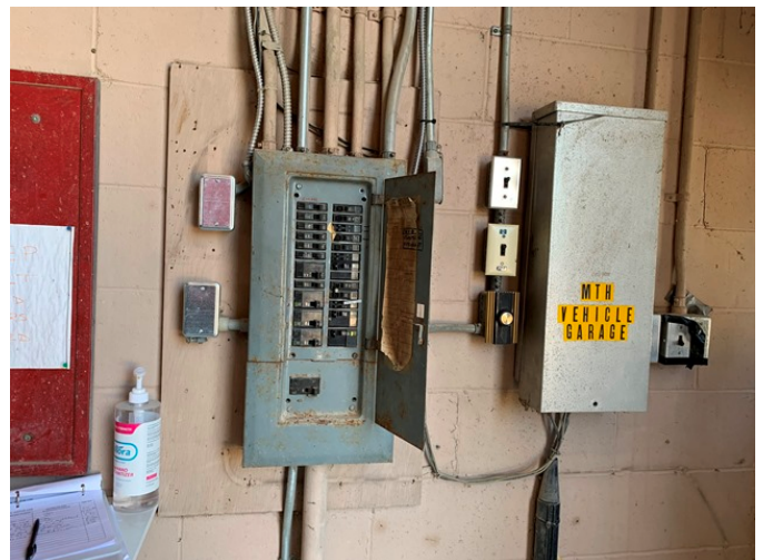
Figure (8) Interior View – Electrical Panel is aged and has reached the end of its useful life