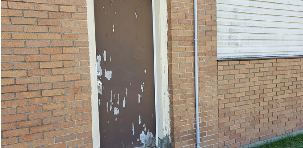
Figure (4) Exterior of Building & Damaged Hollow Metal Door