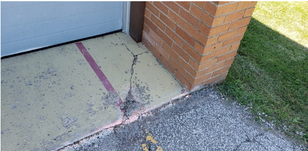
Figure (2) Bay Door Access – Slab on Grade Cracks