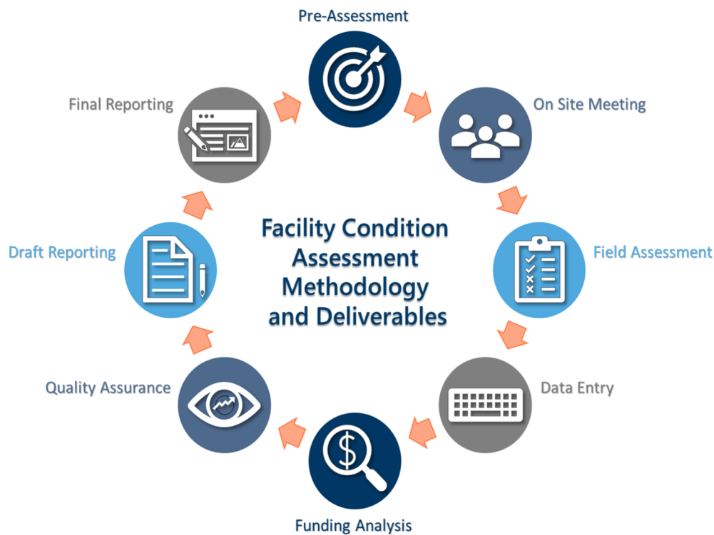
Figure 1: J.S. Held's Facility Condition Assessment Methodology and Deliverables Process

Figure 1 shows our process for conducting facility assessments for deliverables that enable our clients to manage their asset portfolios more effectively.