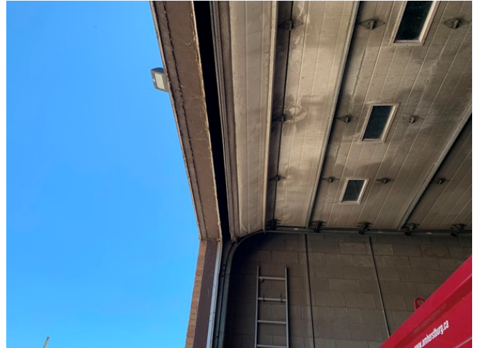
Figure (6) Overhead Doors