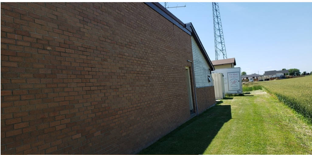
Figure (3) Exterior View of Masonry Brick