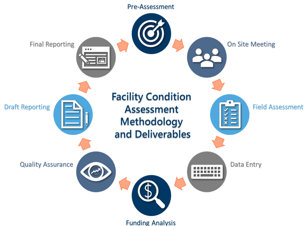
Figure 1: J.S. Held's Facility Condition Assessment Methodology and Deliverables Process

Figure 1 shows our process for conducting facility assessments for deliverables that enable our clients to manage their asset portfolios more effectively.