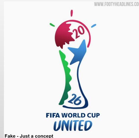
Fake - Just a concept